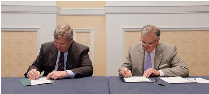
U.S. Agriculture Secretary Vilsack and U.S. Transportation Secretary LaHood, April 2013